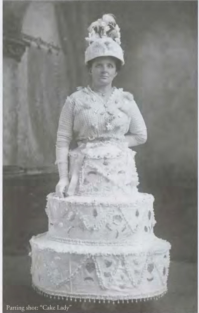
Parting shot: "Cake Lady"

Where creative minds celebrate... past, present and future