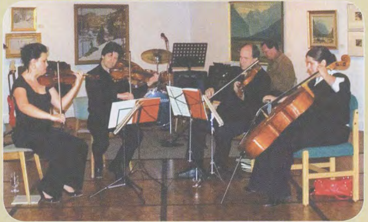
Banff Centre Quartet

The board of directors were humbled by the dedication and hard work of all the staff in making this evening a success. Staff continue to go above and beyond in making these events enjoyable and successful. Thank you!