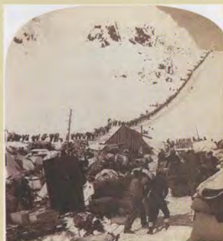
B. Singley, Alaska (USA), 1898 at the foot of Chilkoot Pass, Collection of Museo Nazionale Della Montagna