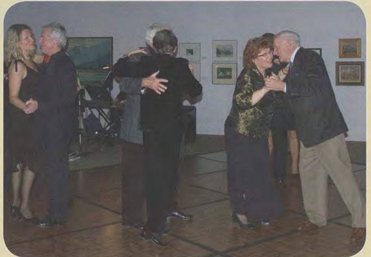
Dancing to the Canmore Jazz Combo