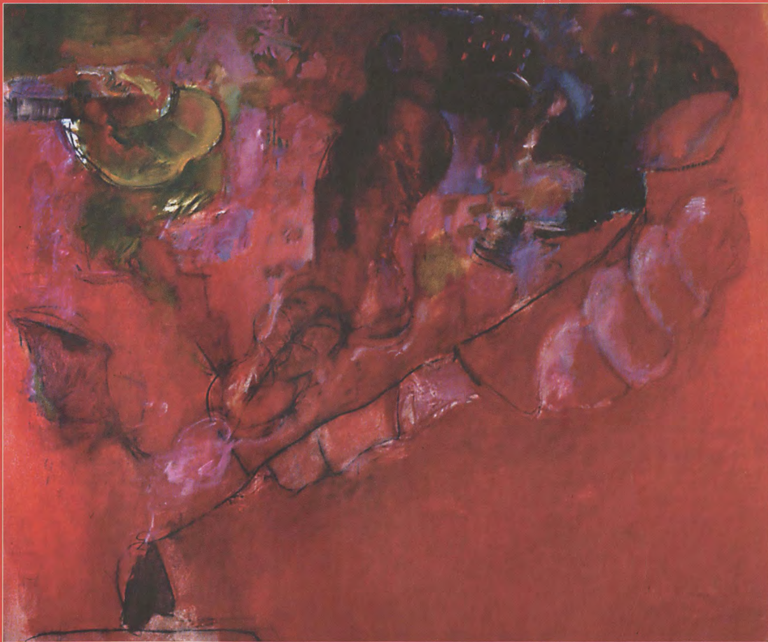
Les Graff: Raising Prairie Form/Red #2 , oil/canvas, 2007, #19 - 51M