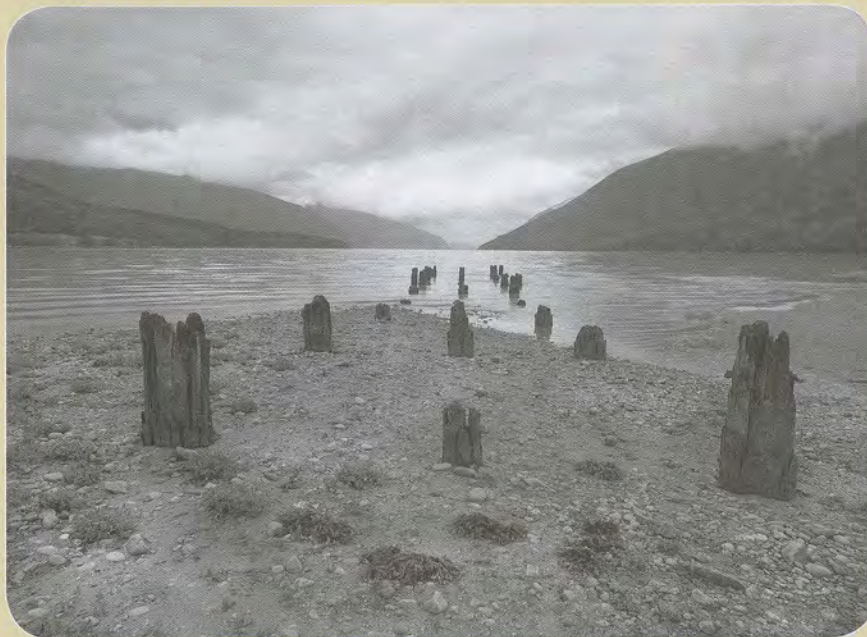
Dyea and pier pilings a contemporary photo by Craig Richards