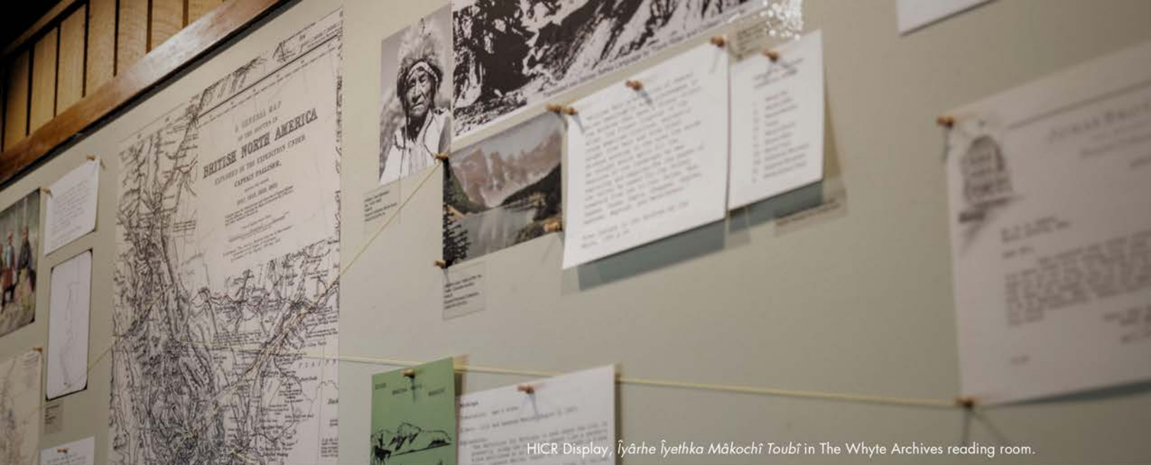
HICR Display, Îyârhe Îyethka Mâkochî Toubî in The Whyte Archives reading room.