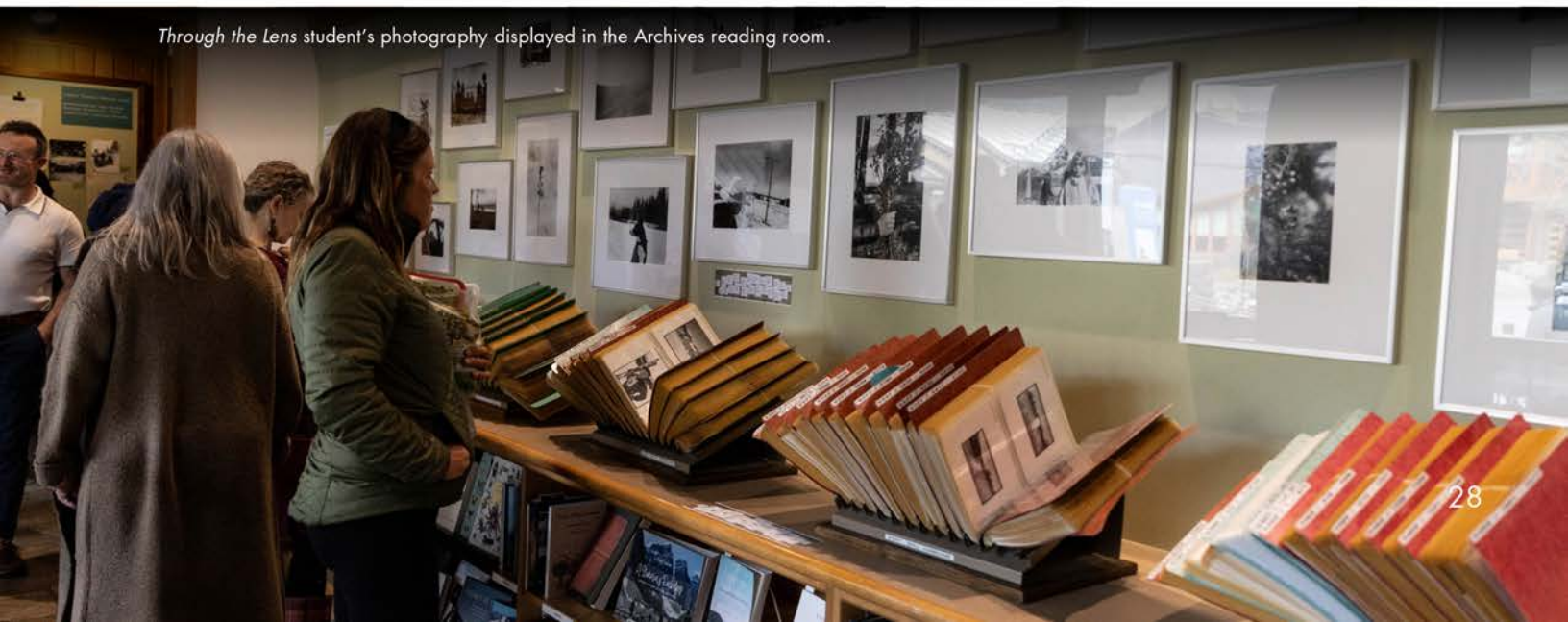
Through the Lens student's photography displayed in the Archives reading room.

For nearly 20 years, from 1997 to 2017, The Whyte hosted a popular outreach program called Through the Lens. This transformational program immersed high school students from Mîni̓ Thnî (formerly Morley), Canmore, and Banff in the creative and technical processes of traditional photography. In 2024, graduates of the original program, Nicolas Latulippe and Soloman Chiniquay revived Through the Lens. Over 600 students participated, resulting in a collection of 1800 photographs, exhibitions and a book. In celebration of the revival, The Whyte hosted an exhibition featuring the work of 21 students wherein participants presented their work to family and friends in the Archives reading room.