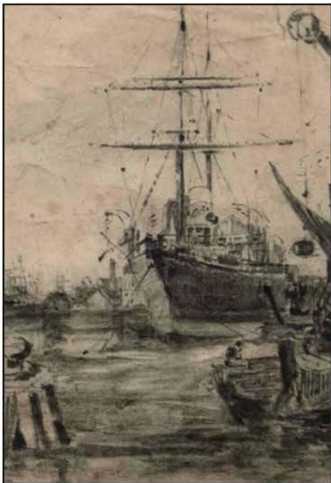
Charles John Collings (1848 – 1931, British) Ships in Harbour (detail). Graphite on paper Collection of The Whyte. CoJ.03.078.

Drawn to the solace of images provided by nature, it is in photographing that Berkhout finds peace. Inspired by the greyscale offered through his negatives, A Natural Solitude revealed Berkhout's exploration of the interplay between light, shapes, shadows, nuances in tone, contrasts and gradients.